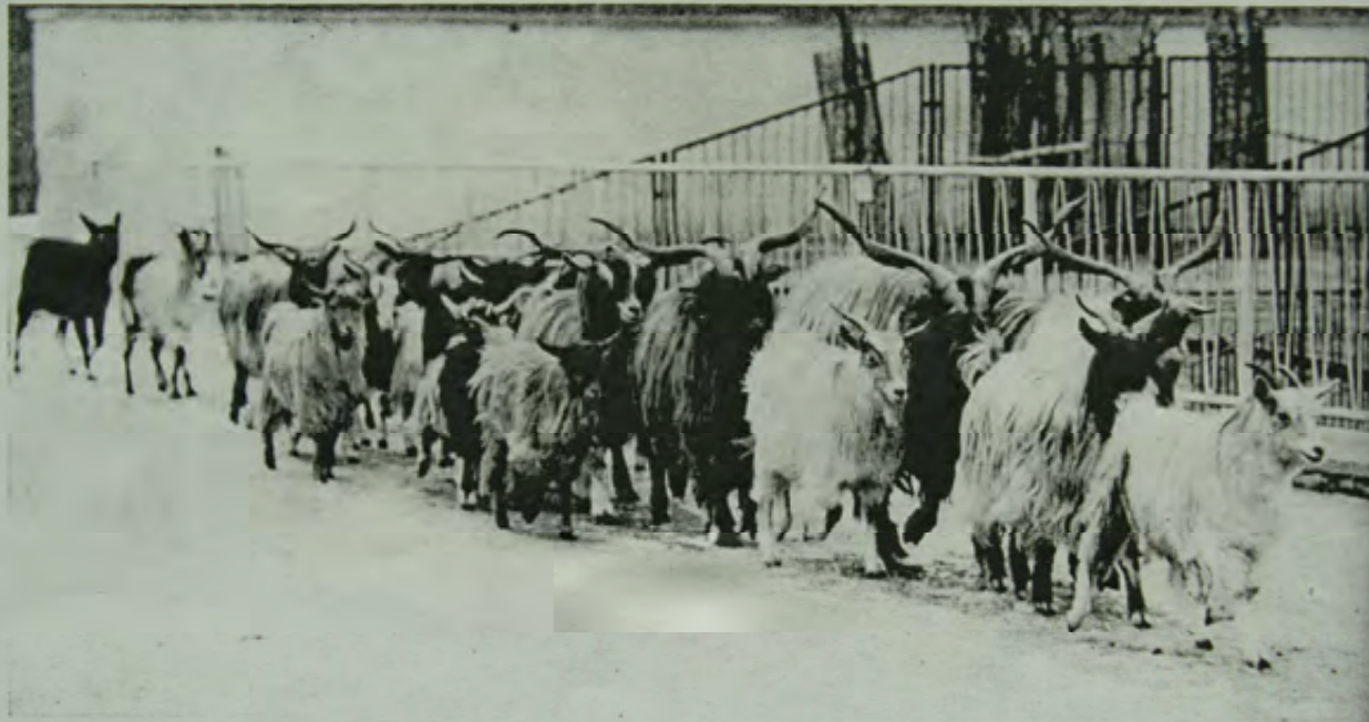
Bulgarische schraubenhörnige Langhaarziegen