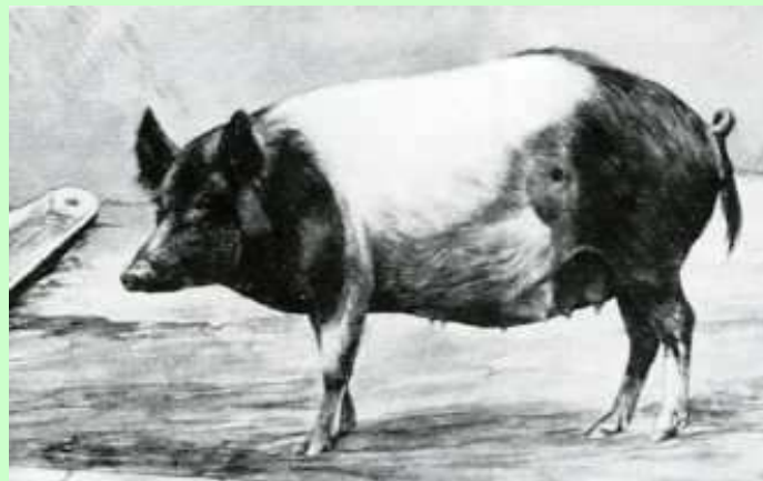
German Pasture, extinct in 1975