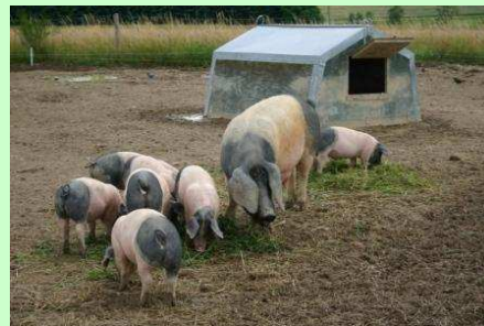
Swabian Hall pig